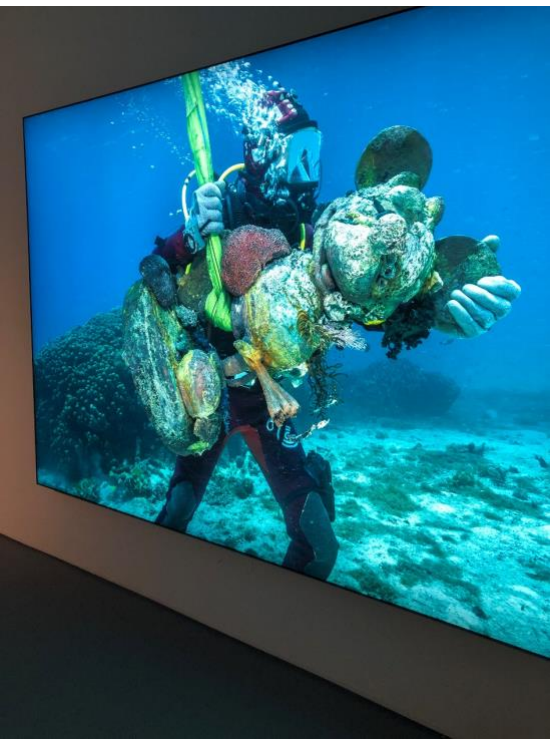
Hazan-Fig 2. Recovering Micky, Photo of video, Treasures from the Wreck of the Unbelievable, released on Netflix

90-minute mockumentary we learn that the Venice biennale exhibition took 10 years to create, and some $65 million to produce but was not the expected comeback exhibition that Hirst had been hoping for. The much more modest Haifa exhibit staged many of the key works, but in spite of the downscaling it was just as unbelievable. The exhibition opened with a video of the fictional discovery of the ancient shipwreck off the coast of East Africa, that supposedly took place in 2008, setting the scene and making for a very convincing entrée into the exhibition.