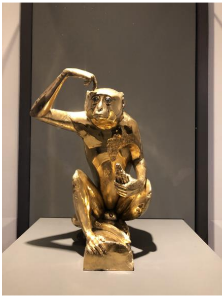
Hazan-Fig 4. Golden Monkey, © Susan Hazan, 2019

Arranged in the Haifa gallery visitors could make the obvious connection from the sea-drenched artworks to the meticulously shiny objects perched on their exquisitely lit pedestals. Micky Mouse's corals and barnacles had been sculpted to perfection, making the trompe d'oeil sculpture highly persuasive.