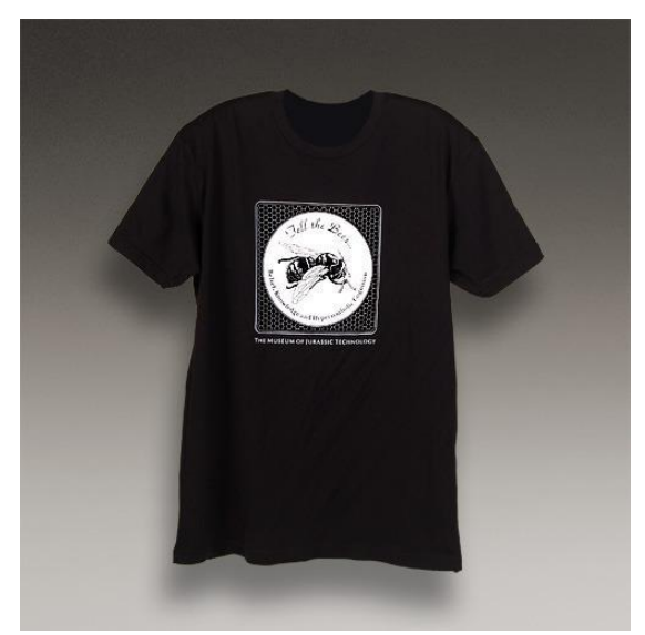
Hazan-Fig 7. Tell the Bees T-shirt, Museum shop, Museum of Jurassic Technology shop

The message of the narrativere resembles the Hellenistic Greek tradition of tying a piece of funeral crepe to a beehive and the practice of bringing 'funeral sweet hives for the bees to feed upon' (see museum website). According to the Hellenistic Greek/ Jurassic tradition, in this way, the bees are then invariably invited to the funeral and have, on a number of recorded occasions, seen fit to attend. The narrative ends in a plea: Like the bees from which this exhibition has drawn its name, we are individuals, yet we are, most surely, like the bees, a group, and as a group we have, over the millennia, built ourselves a hive, our home, not to turn our backs on this carefully and beautifully constructed home especially now, in these uncertain and unsettling times. (Museum of Jurassic Technology website narrative). You can, of course purchase the <i>Tell the Bees T-shirt from the museum shop for less than $20<sup>xxix</sup>.