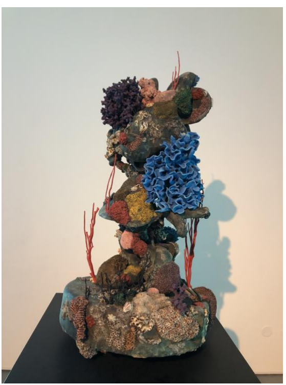
Hazan-Fig 3. Micky Mouse, resin coated to appear bronze and encrusted with aquatic debris, © Susan Hazan, 2019

Hirst reportedly spent $65 million to stage a fictional shipwreck and the complex recovery operation of the antique sculptures, he claimed were ancient artifacts found at sea. Divers pull a barnacle-encrusted Micky-Mouse-like form from