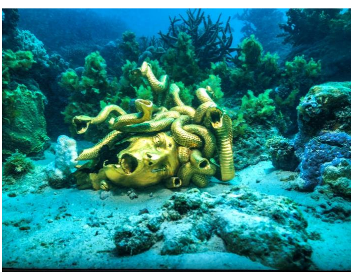
Hazan-Fig \ 5. \ The \ newly \ discovered \ \textit{Medusa}, \ Photo \ of \ video \ in \ the \ gallery, \ \textit{Treasures from the Wreck of the Unbelievable}, \ released \ on \ Netflix, \

Through this lavish display of art and artist, Damien Hirst tricks us into believing the veracity of our own eyes, as well as institutional framing of a work of art in a museum — exploiting our implicit trust; yet confounding the truth in such institutions. Sadly, at the end of the day, what he is saying is that ultimately the truth no longer exists anywhere, anymore and no institutional framing can persuade us otherwise.