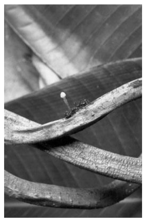
Hazan-Fig 8. Megolaponera Foetens, the stink ant of the Cameroon of West Central Africaxxx

According to the Museum label, this spike is about an inch and a half in length and has a bright orange tip heavy with spores, which rain down onto the rain forest floor for other unsuspecting ants to inhale. Interestingly, in a Google search on the stink ant , apart from the direct links to the Museum of Jurassic Technology, several links lead to well organized entomology and biology websites, which all in turn link to the Museum of Jurassic technology and the one and only reference to the Megolaponera Foetens . (This does not in any way preclude either the existence of the ant or its strange tale, but, in an effort to forage for further information, I did write to the museum for further information on this point, but, as yet, received no answer). Exhibiting the bizarre, paranormal, beguiling, and merely baffling, Mr. Wilson's museum no doubt captures the imagination of all who visit; the blur between the astonishingly real and the fabulously fake, however, is likely to leave the visitor dizzy and perplexed.